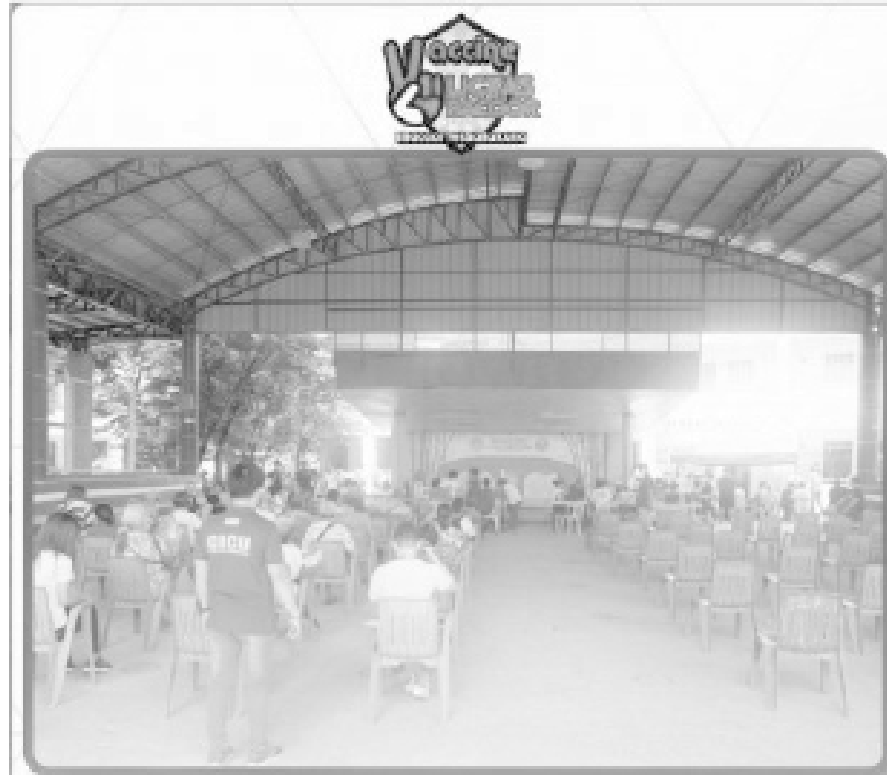
LISTAS BACOR COVID19 VACCINE ONLINE REGISTRATION http://ceir.bacoor.ph @CityOfBacoor @norzagaray.ph @PIOBacoor