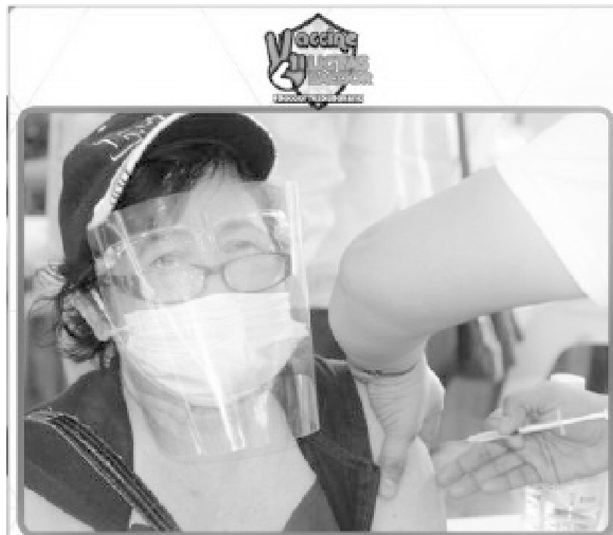
LISTAS BACOR COVID19 VACCINE ONLINE REGISTRATION http://ceir.bacoor.ph @CityOfBacoor @norzagaray.ph @PIOBacoor

Nadagdagan ng 966 Bacooreño ang fully vaccinated na ngayong araw na ito. Sa tatlong vaccination sites ay nakatanggap ang ating mga kababayang ng kanilang second dose ng vaccine. Sa Niog Elementary School ay 283 ang nabakunahan, sa Bacoor Coliseum ay 287, at sa Queens Row Elementary School ay 396.